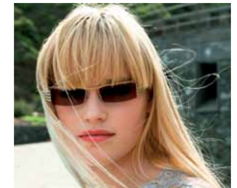
Darkens to a tint when outdoors