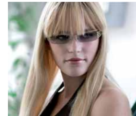
Activates in mid-light