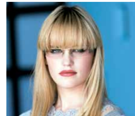
Clear when indoors